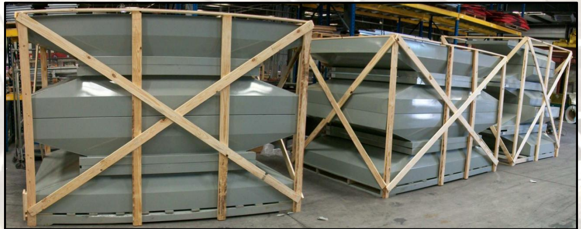
And the best curbs in the business!