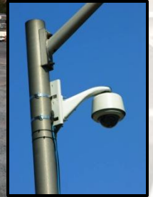
Secure Fenced Lot with Video Surveillance