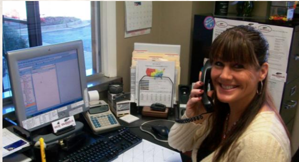
Customer Service Lead